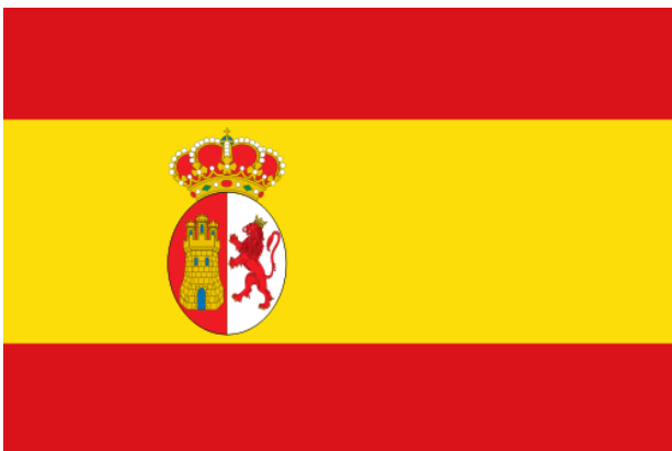
Spanish Louisiana flag (1763-1800)

Know the following facts about these flags. Be able to answer historical questions.