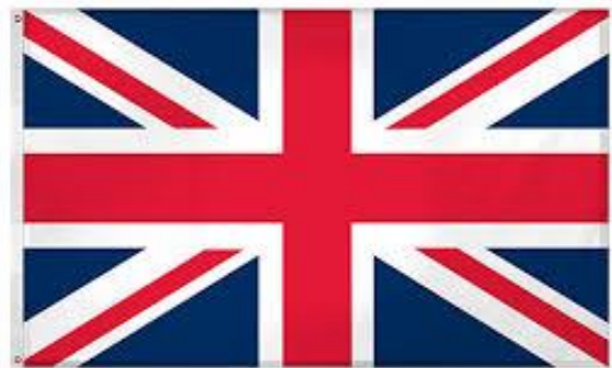
British flag (used in Florida Parishes region, 1763-1810)